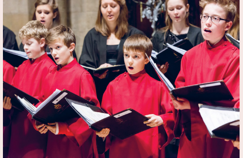
Jesus College Choir

TICKETS: £25, £18, £15, £12 (£5 students, unsighted) available from The Shop at King's: 01223 769340; www.shop@kings.cam.ac.uk