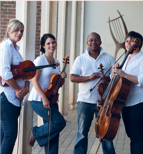
Odeion String Quartet

TICKETS: Admission free, retiring collection